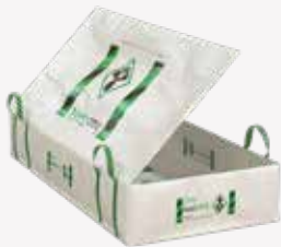
2.5m3 haziSAFE® Bag (320cmx150cmx53cm)