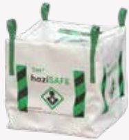
1m3 haziSAFE® Bag (100cmx100cmx100cm)

Our UN Certified haziSAFE® bags provide a very efficient and cost effective containment solution to demolition and decontamination companies. Our haziSAFE bags provide a safer and smarter way to transport hazardous waste and with a safety weight load of 1250kg, you can't go wrong.