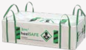
3m3 haziSAFE® Bag (250cmx150cmx80cm)