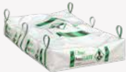
1.5m3 haziSAFE® Bag (250cmx150cmx40cm)